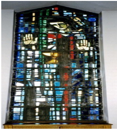
St John the Evangelist Stevenston