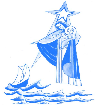
Our Lady Star of the Sea Saltcoats