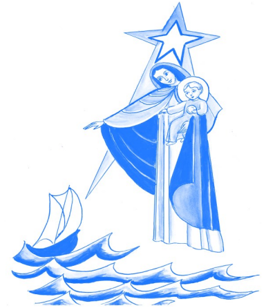
Our Lady Star of the Sea Saltcoats