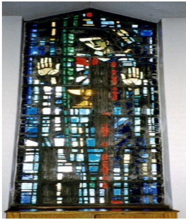
St John the Evangelist Stevenson